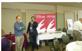
Tradeshow 2013 in Gimli

We are looking for businesses and organizations to take part in the Trade Show at this year's conference or